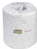
SCA Tork® Premium 2 Ply Roll Bath Tissue

Elegantly embossed that enhances bulk and softness. The easy start tail seal prevents waste. Rapid break-up capabilities is ideal for all plumbing systems. Wrapper: Overall; Roll Diameter: 4.25. Use Dispenser 59TR. 400 Sheets per roll, 96 rolls per case.