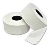
Affex Jumbo Roll Tissue Available 1 ply and 2 ply.