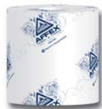
Affex Toilet Tissue 2 Ply. 500 ct.