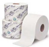
WausauPaper® EcoSoft™ Green Seal® OptiCore® Tissue

This quality tissue is 100% recycled and exceeds EPA guidelines for post-consumer waste. Embossed. Environmentally preferable packaging. 2 Ply. Controlled-use tissue w/OptiCore™ 2-part core technology. Use Dispenser: 80200, 80300, 82300. 865 sheets per roll, 36 rolls per case.