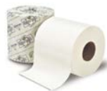
WausauPaper® EcoSoft™ Green Seal™ Tissue

Green Seal® 100% recycled universal tissue. Certified by Green Seal, Inc. in Washington, DC. Meets environmental standards. 2 Ply. Use Dispenser: 72200. 500 sheets per roll, 96 rolls per case.